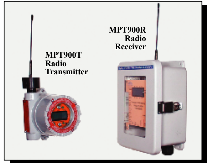
Wireless Radio Transmitter (MPT900T) and Wireless Radio Receiver (MPT900R)

The Mil-Ram Wireless Telemetry System is Multi-Process in that any 2-, 3- or 4-wire field installed process transmitter/transducer ( temperature, pressure, humidity, flow, pH, conductivity, etc. ) that generates a 4-20mA signal can be equipped with a radio transmitter and the data continuously sent to the control system via wireless communications. The radio transmitters/receivers utilize advanced data recognition techniques to ensure data reliability and integrity; corrupt data is automatically rejected. The radio transmitters/receivers have LCD displays for easy configuration which simply involves selection of specific addresses for each field installed 4-20mA transmitter. Addressing provides a unique identity for each 4-20mA transmitter to eliminate cross-talk interference with other devices.